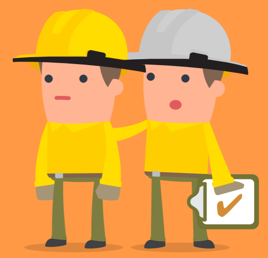
Crew Safety Briefing