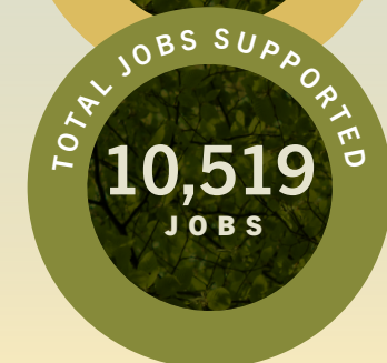
TOTAL JOBS BY SECTOR